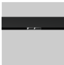
L2 MOVE IT 45