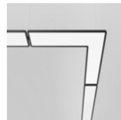
TASK S suspended system