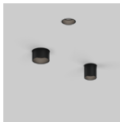
MOVE IN round recessed