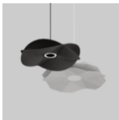
SOUNDCATCHER acoustic suspended