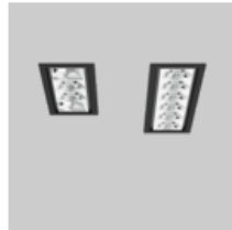
UNICO L4 / L6 basic recessed