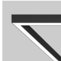
MINO 60 ceiling / suspended system