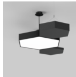
HEX-O suspended group